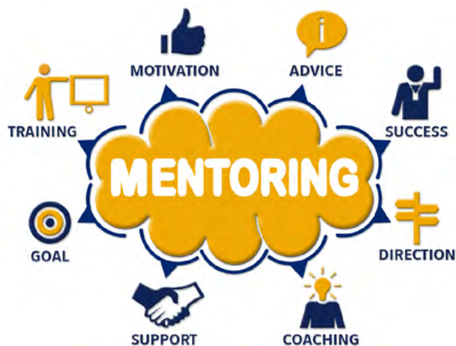
Figure 2: Mentoring connects factors such as motivation, coaching, and support

Africa, and enhancing platforms like NASAC’s Women for Science (WfS) Working Group, which promotes gender integration and collaboration among national academies. Governments and development partners can further reinforce these efforts by investing in regional forums – such as COMSTEDA and the UNESCO/AU STEM conferences – that provide spaces for mentorship, networking, and cross-country learning.